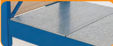
Complete with footplates

Optional galvanized decking - Just add 50% to heavy duty price (heavy duty loads apply)